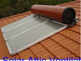
Solar Attic Ventilation